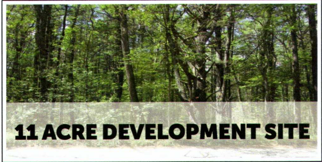
11 ACRE DEVELOPMENT SITE